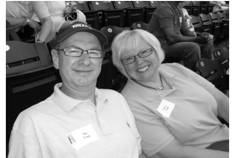
The Mud Hens may have lost the game to the Syracuse Chiefs, but the All-American buffet picnic in the Roost was a winner.