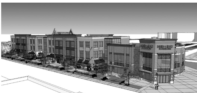
This rendering shows what the new Dorr Street Gateway Project may look like when finished