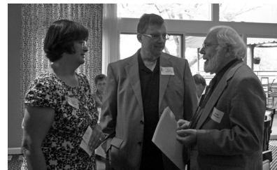
Everyone enjoyed the annual meeting luncheon in June at the Belmont Country Club: good food, fun and catching up with friends.