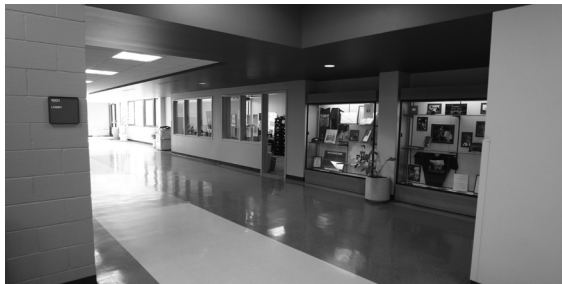
The renovated Center for Performing Arts features a more spacious lobby.

The University of Toledo celebrated more than $2 million in renovations and improvements to the Center for Performing Arts with a rededication event in October.