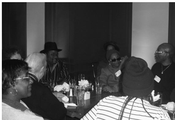
Waiting for those scrumptious desserts.

Several legislative proposals have been introduced to deal with repeal of the GPO/WEP: