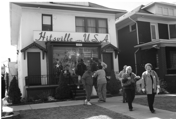
First day of Spring was enjoyed at the Motown Historical Museum.