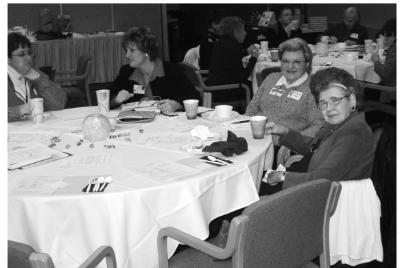
UTMC Satellites Auxiliary and UTRA retirees enjoyed lunch and talk on "Where Did I Put My Keys"