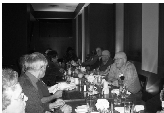
Enjoying lunch at the Soul Food Cafe.