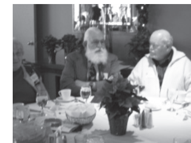
Belmont Country Club was decorated so beautifully for our holiday lunch. We had a successful 50/50 raffle to increase our scholarship fund, and stuffed animals were donated by members to the UT Medical Center to help calm children.