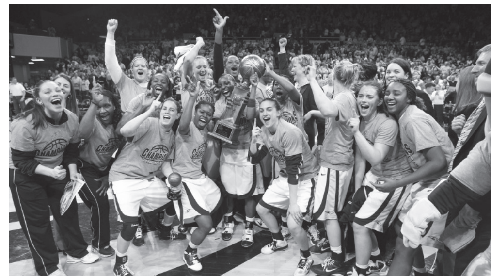
The Rockets celebrated and posed for photos with the WNIT Championship trophy after beating Southern Cal, 76-68, April 2 in front of a school and Mid-American Conference women’s basketball record 7,301 fans in Savage Arena. The historic postseason run saw Toledo become the first MAC basketball program to capture a national postseason tournament. The Rockets, who won the regular-season MAC Championship, extended their home winning streak to 18 games and finished their landmark season 29-8 and 14-2 in the MAC.