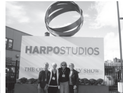
Windy Chicago: Gusts of 60 to 70 miles per hour caused us to delay seeing the view from the Willis (Sears) Tower, and the cruise on the lake was changed to an architectural river cruise. Wind did not prevent us from enjoying Grant Park, Millennium Park, Willis Tower, the Art Institute of Chicago, Navy Pier, Shedd Aquarium and shopping at the Water Tower Place.